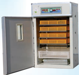
NH-880 Capacity:880eggs Size:980*710*1350mm Weight:85kg