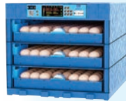
NH-48/96/112 Capacity:48/96/112eggs Size:540*540*280/380mm Weight:5kg/6.5kg