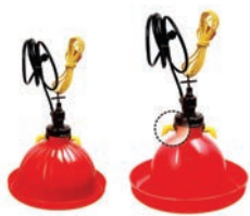
Bio auto drinker