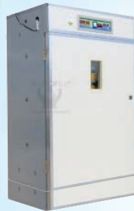
NH-1056 Capacity:1056eggs Size:1360*730*1350mm Weight:105kg