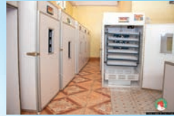
NH-176/200 Capacity:176/200eggs Size:730*580*950mm Weight:43kg