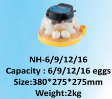
NH-6/9/12/16 Capacity : 6/9/12/16 eggs Size:380*275*275mm Weight:2kg