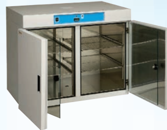
NH-1584 Capacity:1534 eggs Size:1400*900*1370mm Weight:123kg