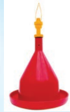
Small Auto drinker