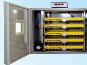
NH-64/128/192/256/320 Capacity:64/320eggs Size:490*460*210mm Weight:7.1kg/9.7kg/12.2v/15.7kg/18.2kg